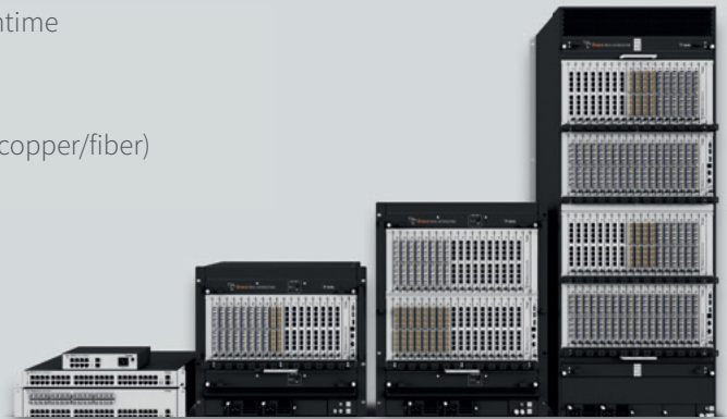
The Draco tera matrix system. Available in a range of sizes from 8 to 576 ports.