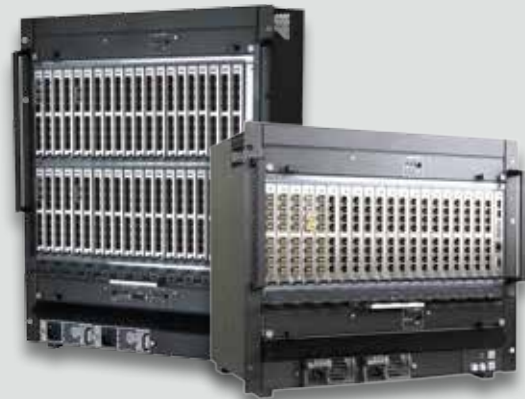
The Draco tera matrix system. Available in a range of sizes from 8 to 576 ports.