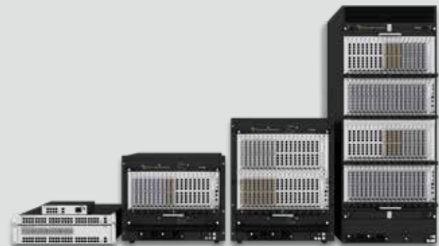
The Draco tera range. From 8 to 576 ports.