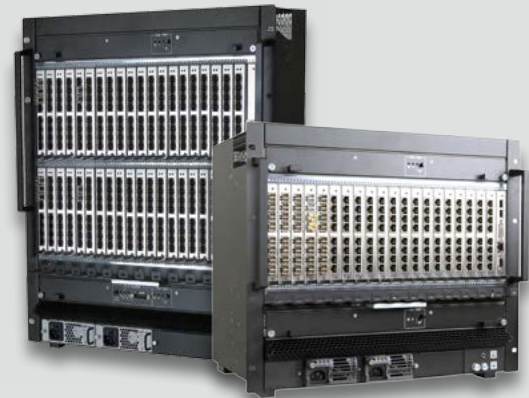
The Draco tera matrix system. Available in a range of sizes from 8 to 576 ports.