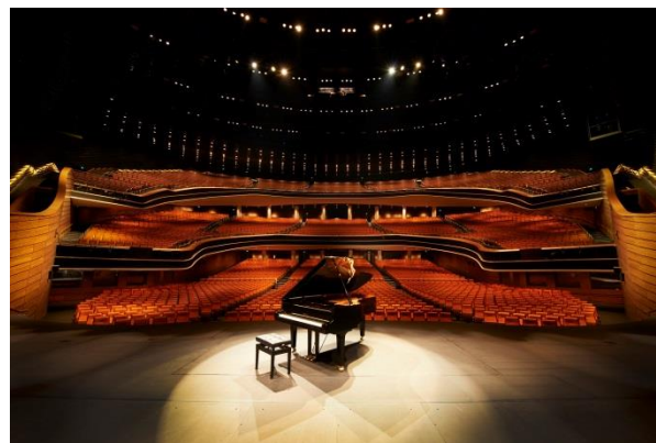
The Star: theater hall