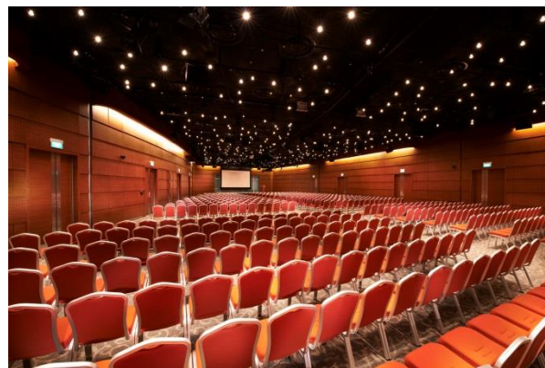
The Star: gallery

The sheer size of the complex – covering 38,000 m 2 and 9 floors – means that some data has to travel in excess of the normal maximum distance for HD video signals on copper cables of around 140 meters. BES took advantage of the ability of the Draco tera system to mix fiber outputs alongside Cat X copper, allowing connection to be made to workstations up to 1 km away from the switch using multi-mode fiber.