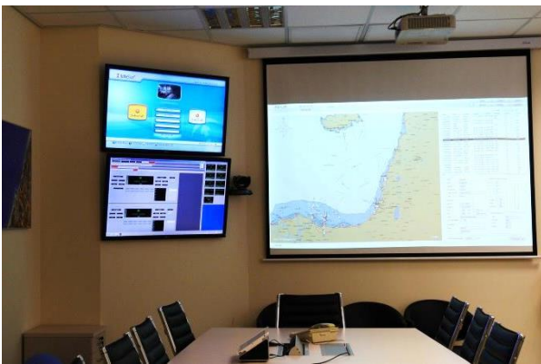
Haifa RCC: Conference room

A dedicated video conferencing system is directly connected through a CON Unit and a CPU Unit, enabling bidirectional data distribution. Digital KVM signals, received from remotely located sources, can be transferred to an Extron sound system, while video data produced in the conference rooms, is transmitted to the matrix providing access for all receiving devices.